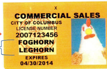
2014 Issued Card