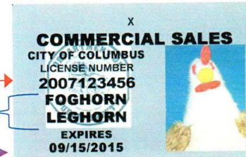
2015 Issued Card