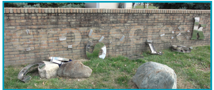
2010 Letters Vandalized