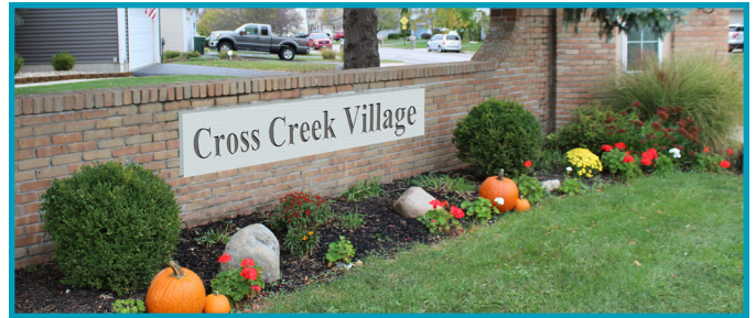
2023 Proposed Signage